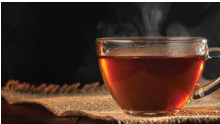
CITRON GREEN TEA